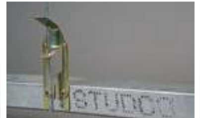
M534 Spring Hanger With fixing holes for preliminary suspension of bulkheads and floating ceilings.