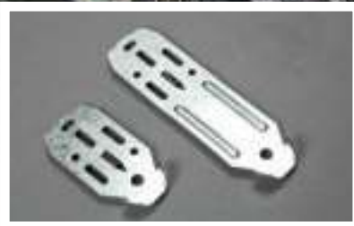
M13/M16 Direct Fix Batten Clips Now with extra fixing slots and incorporated knock in holding tab for fixing into timber beams.