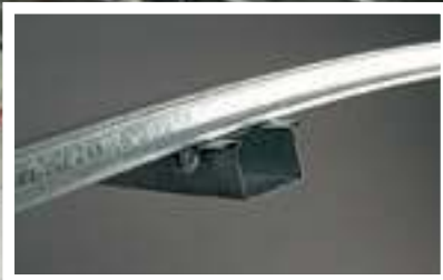
M27R Top Cross Rail Can be rolled to create curved ceilings.