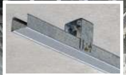
Slimceil Ceiling System The engineered low clearance ceiling system.