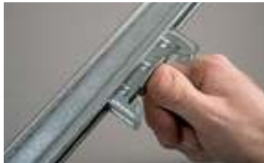
M39 Locking Key Primary coupling with unique thumb push tab providing ease of installation.