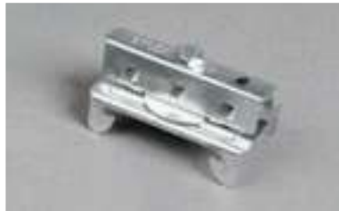
M238 Swivel Locking Key Multi-directional locking key clip that is useful in difficult grid setout situations.